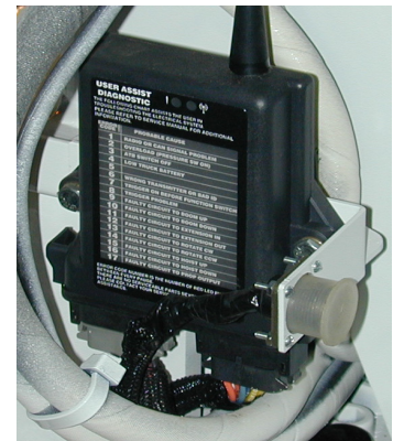
Crane Control Receiver