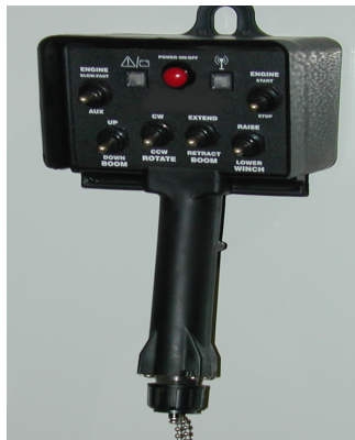
Crane Control Transmitter