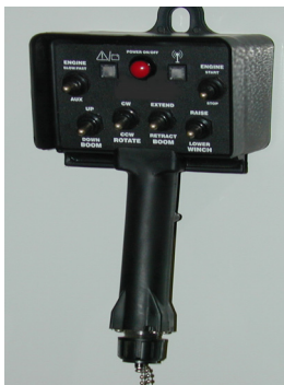
Crane Control Transmitter