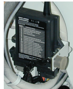
Crane Control Receiver